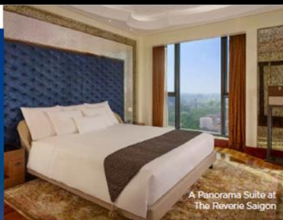
A Panorama Suite at The Reverie Saigon