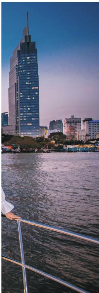
· The Reverie Saigon takes to the water with 60 feet of Italian elegance. 西貢萬鎮酒店購入 18 米長豪華遊艇，再度提升越南奢華款待水準。

Formerly called Saigon, Ho Chi Minh city in Vietnam exudes an old-world elegance reminiscent of the French quarter it used to be. In the eyes of celebrated French writer Marguerite Duras, it is undoubtedly the capital of romance.