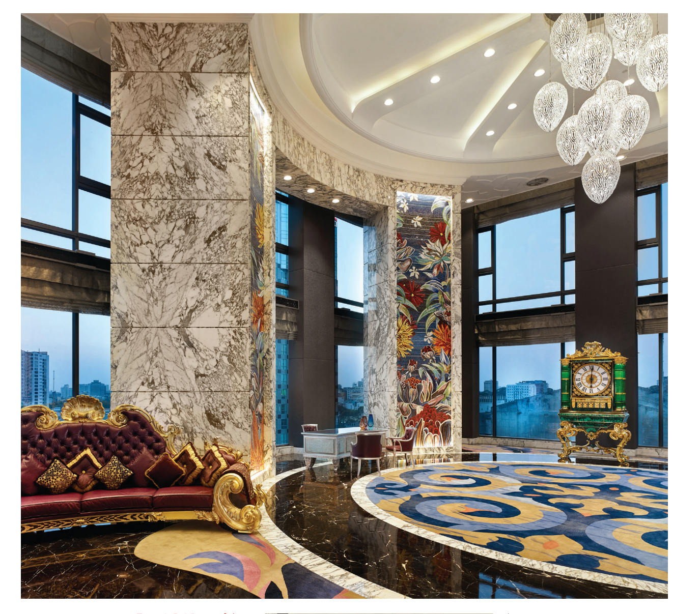
From L-R: Views of the Sông Sài Gòn river; 3,000 tonnes of marble were used throughout the hotel

The Reverie's District 1 location puts you in spitting distance of landmark sites like Reunification Palace, the city's neo-classical Central Post Office and French Colonial Opera House. The hotel also straddles fashionable Dong Khoi Street, home to contemporary restaurant Vietnam House.