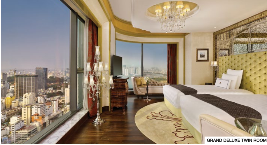
GRAND DELUXE TWIN ROOM

Arriving at Ho Chi Minh City's airport is a chaotic whirl and culture shock. The accustomed humidity of Brisbane is nothing compared to what hits us immediately as we step off the plane. It's 7am and the city is already pulsating with people, and most notably, motorbikes. There are almost as many bikes as people in this city of 8.6 million and we're ready to be hauled along for the ride.