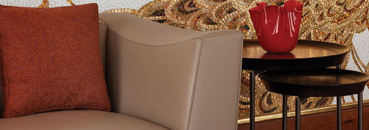
DESIGNER SUITE BY GIORGETTI