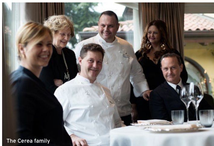
The Cerea family