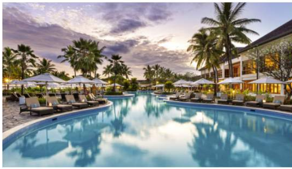
Sofitel Fiji Resort & Spa, Fiji.