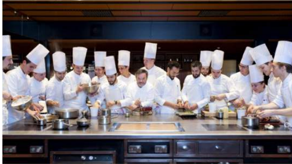
The kitchen team at Troisgros.