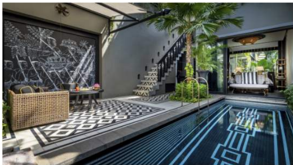
Your private villa pool at the Bensley Collection Shinta Mani, Siem Reap.

THE WINNER: Bensley Collection, Siem Reap, Cambodia