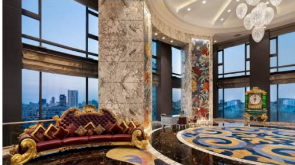
The Reverie's lobby.