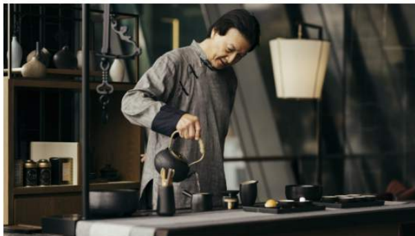
Get a welcome tea ceremony at The Clan Hotel, Singapore.