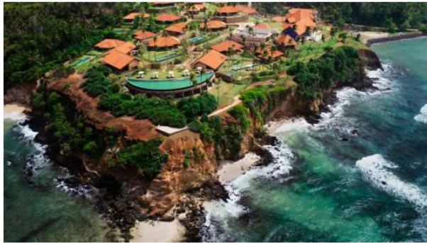
Cape Weligama may have the most photogenic swimming pool in the world.