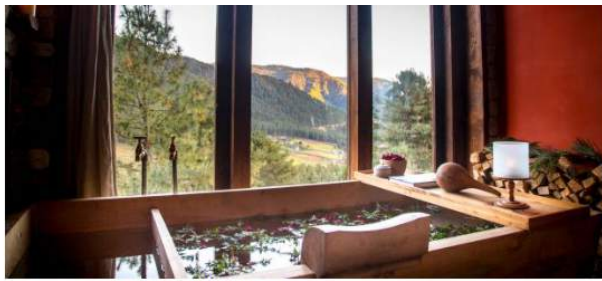
Gangtey Lodge, Phobjikha Valley, Bhutan: Sink into the pinewood bathtub at the Australian-designed bathhouse.