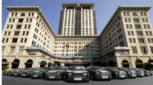
The Peninsula Hong Kong's famous fleet of Rolls-Royces.