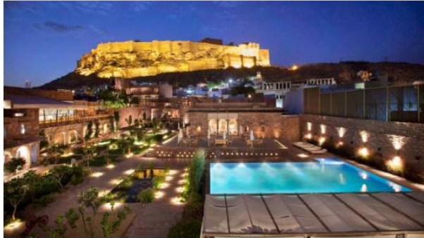
RAAS Jodhpur, India Knockout: 17th-century Rajasthan architecture in ornately carved sandstone fuses with contemporary additions.