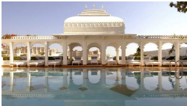
Taj Lake Palace is fashioned entirely from marble in the Mughal style.