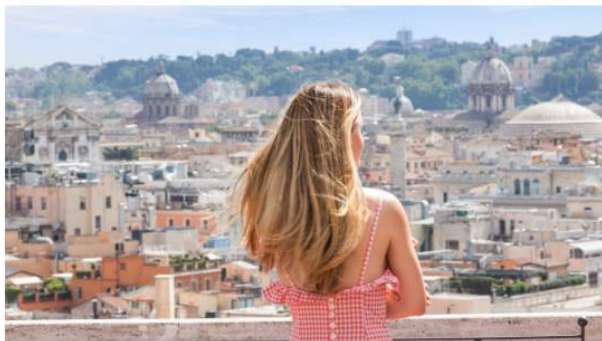
Mingle with the beautiful people at Hotel de la Ville's rooftop terrace.