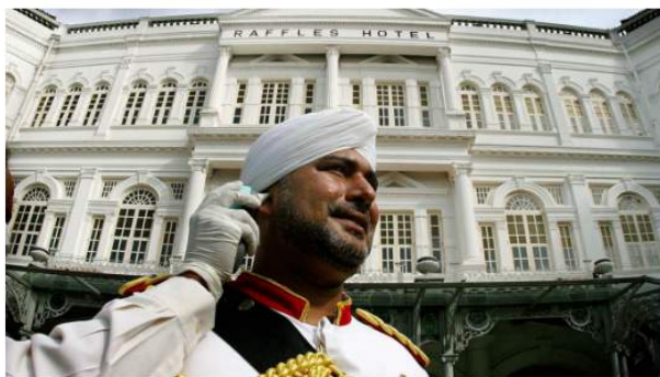
The traditional, tall and at times faintly intimidating Sikh doorman at Raffles Singapore.