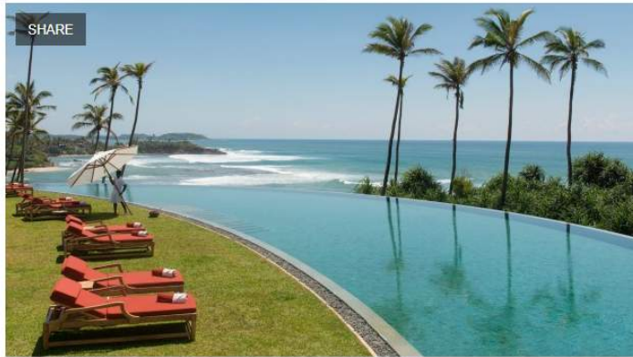
Cape Weligama, Sri Lanka: This might be the most photogenic pool the in the world.